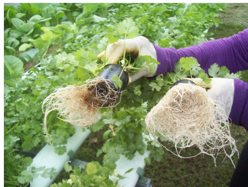
Anh Ah showing the typical difference between Untreated (Left- affected by Pythium) and Treated (Right- clean healthy roots) in Coriander.

Other improvements noted by the farm include: