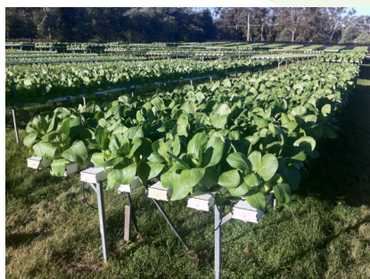
Protected and unprotected Hydroponic systems

Fertilizer is added to the irrigation water using automated dosing tanks. Electrical Conductivity (EC) is maintained at 1.1 mmhos/cm, pH is maintained at approximately 6.4, and late summer temperatures average 89°F.